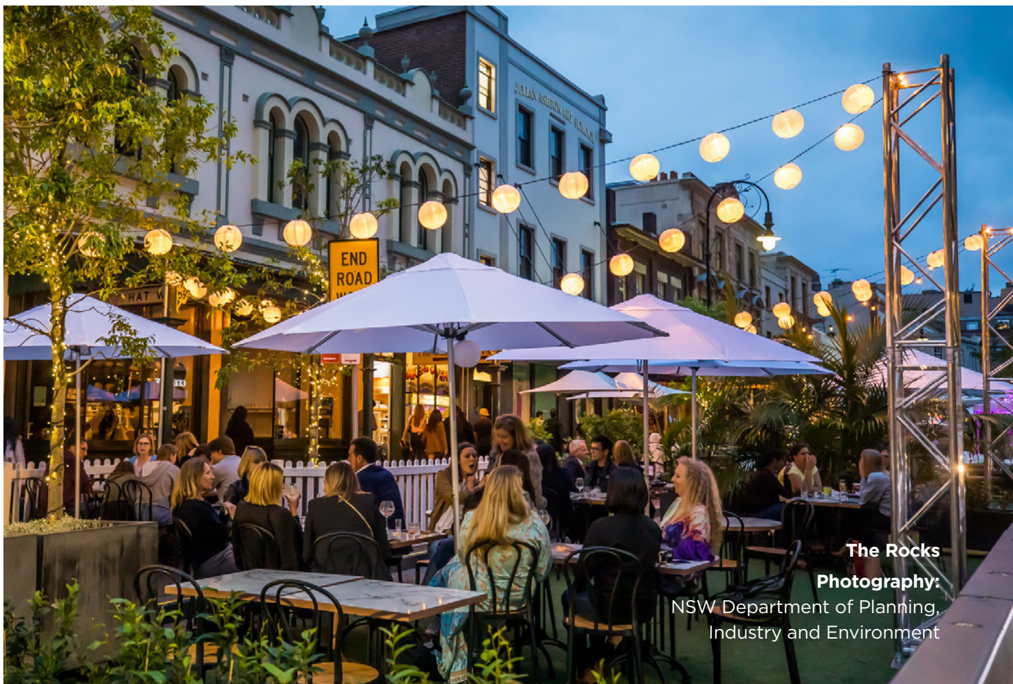
The Rocks

NB. items 2 and 3 may be used by the Department in media and/or webpage